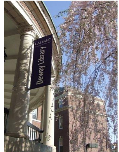
Dewey Graduate Library

Access to excellent library facilities is essential for a successful graduate education. At UAlbany, we have three libraries that support your learning and scholarship